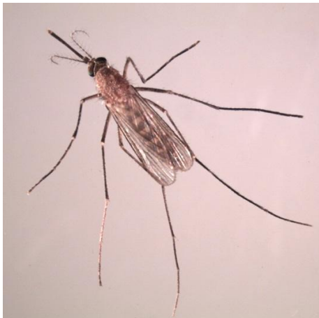
Figure 1: Female Culex quinquefasciatus .

Mosquitoes are small slender flies that belong to the order Diptera (true flies). Like other members of this group, mosquitoes possess only a single pair of functional wings. They are distinguished from other flies by the following characteristics: the presence of scales (on thorax, legs, abdomen and wings), extended mouthparts (proboscis) and narrow wings (Fig.1).