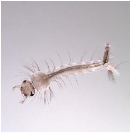
Figure 3: Culex quinquefasciatus larva.

length and are initially white when laid, but quickly darken ranging from brown to black in color (Fig 2). Larvae typically hatch from these eggs within 2 days (Fig. 3).