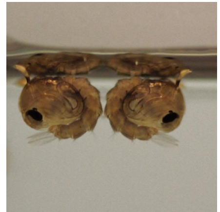
Figure 4: Culex quinquefasciatus pupae.

Monitoring: Surveillance of mosquito activity is key to establishing a successful mosquito management program. Surveillance provides important information including the species of mosquito present in an area, the location of immature breeding sites, changes in species abundance, prevalence of mosquito infection with important human and animal pathogens, and whether control methods are having an impact on mosquito populations. Two of the most common traps used to survey adult mosquitoes are the light trap and the gravid trap. Light